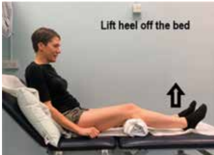
Lift your heel off the bed