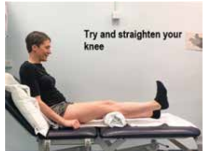
Try and straighten your knee

As your ability to move the knee improves try this next one.