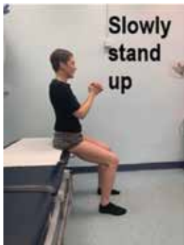
Slowly stand up