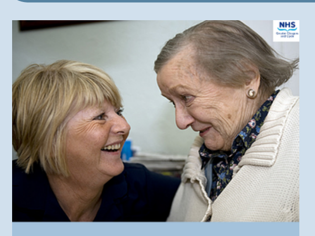
Care Home Winter Readiness Pack 24/25

Preparing for winter is an important part of support to residents and staff in care homes across the Greater Glasgow and Clyde area. This pack contains a range of useful winter readiness information and planning resources.