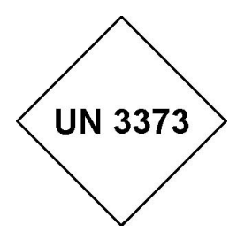
Biological Substance Category B

All samples must be packaged in containers compliant with UN packaging instruction P650 Packaging and transport requirements for patient samples — UN3373 - GOV.UK (www.gov.uk) and labelled as shown below. Information with regard to high risk specimens must be clearly displayed on both sample and request form.