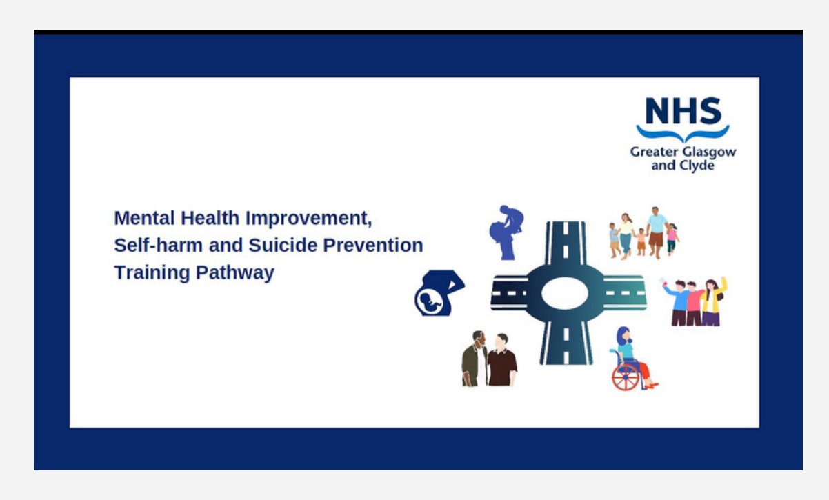
Click on image to download pathway

The pathway is a tool to encourage the public health workforce to progressively build their knowledge and skills relevant to their role and responsibilities in the area of mental health. The resource is not a training calendar but rather a reference and guidance document to help individuals, teams and organisations explore potential training opportunities that are available, and whilst not exhaustive it can support navigation through the relevant and appropriate levels according to roles.